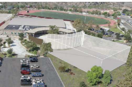
Future site of Performing Arts Center