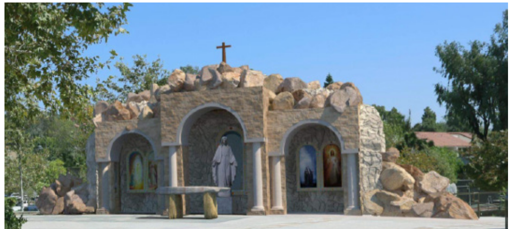
Proposed Grotto in honor of the Virgin Mary.