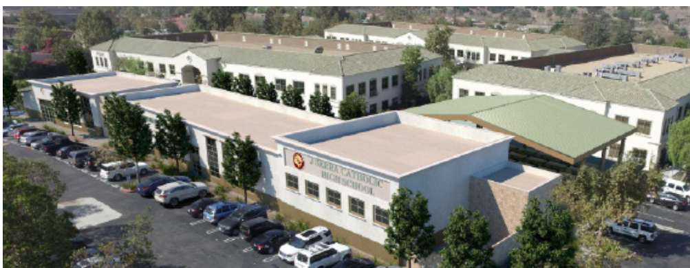
Proposed new academic building dedicated to additional classroom space for the arts

Students have unique interests and experiences that shape their time at JSerra, but each one graduates prepared to flourish in his or her college pursuits. Attending schools such as the University of Notre Dame, Harvard, Duke, Stanford, UCLA, Georgetown, UC Berkeley, and MIT (to name a few), JSerra Lions are successfully and confidently facing the world before them.